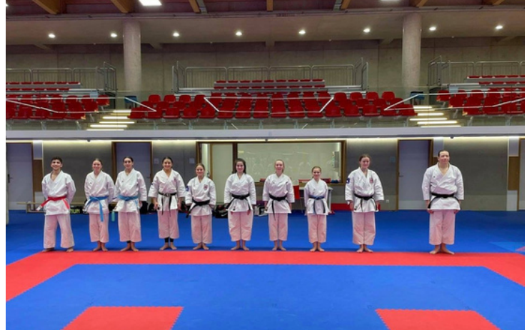
Our Kata athletes in the national hall during training