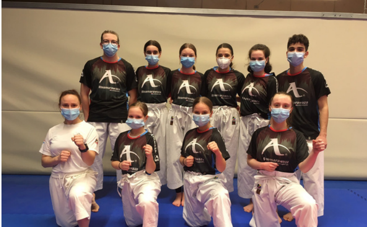
new Arawaza T-Shirts for the Kata athletes